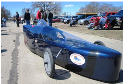
A51 at the Columbus Rally

This month has been one of many ups and downs. We have been to two rallies so far this year. The first rally of the year at the Lincoln tractor testing facility was cancelled due to snow. The weekend after that race was scheduled our team went to Columbus and West Point the day after that.